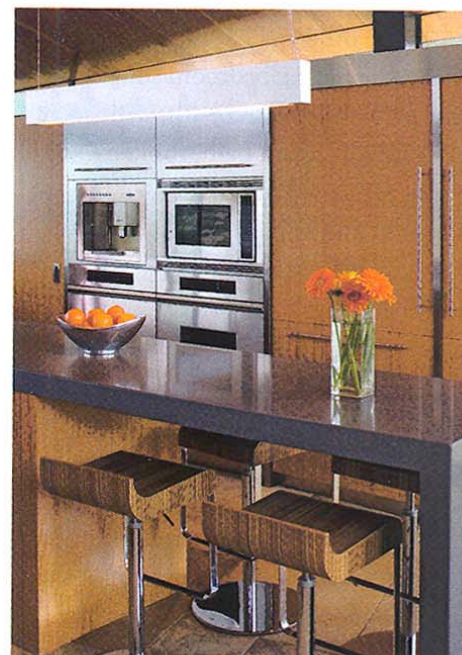
Breakfast takes place around the CaesarStone countertop at the east end of the kitchen. The outdoor barbecue area and pool are just out of sight to the right.

Just beyond the countertop is a 130-bottle wine rack, and that's a story all its own.