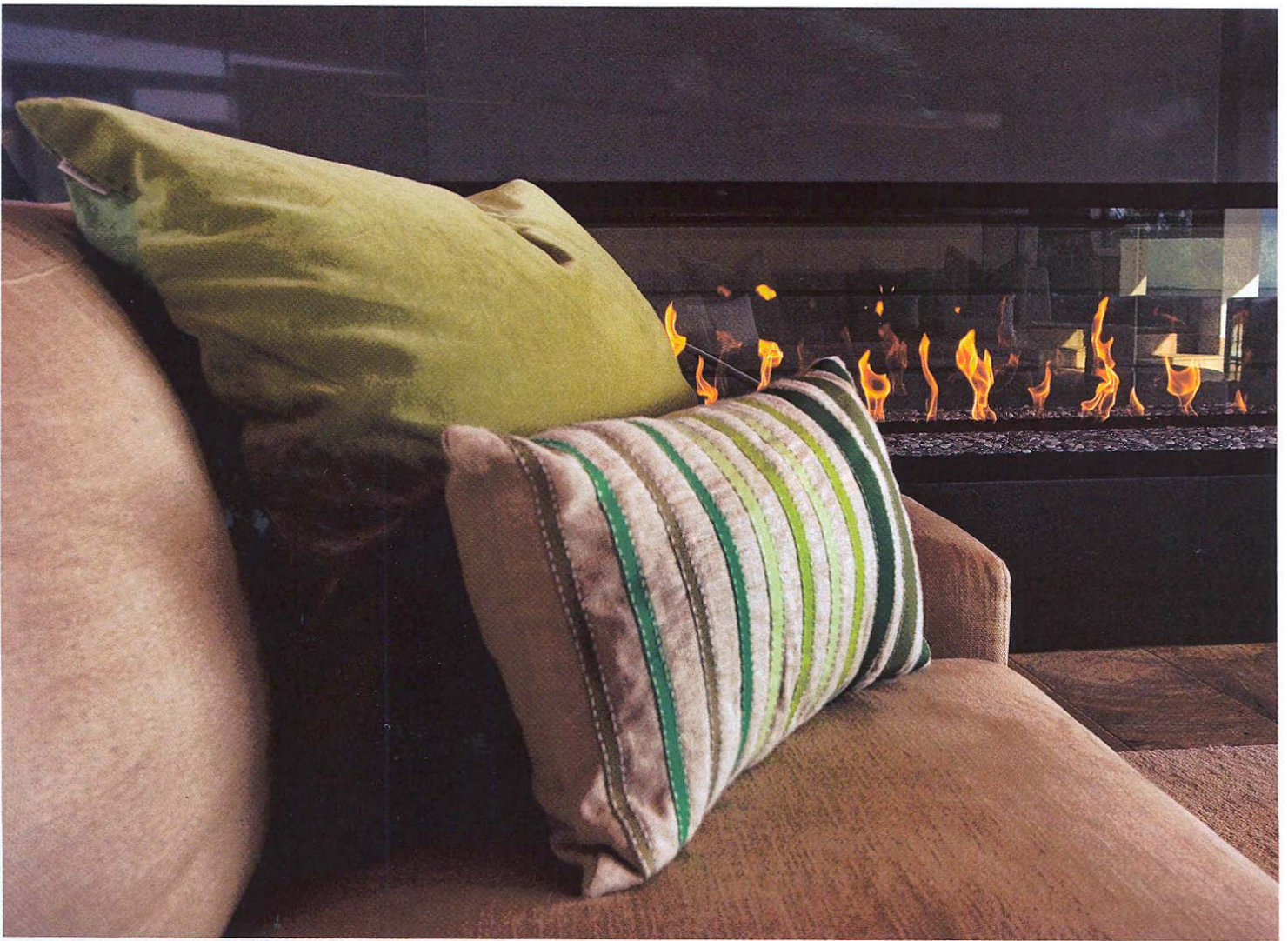
A linear fireplace from Canada heats up the living room area as a radiant heat system in the floor warms up the rest of the house. But extra levels of insulation have reduced and even eliminated the need for heating, even in cold winter months.

on the property, and the possible historic importance of the original home built for Guy Fleming, founding president of the Torrey Pines Association.