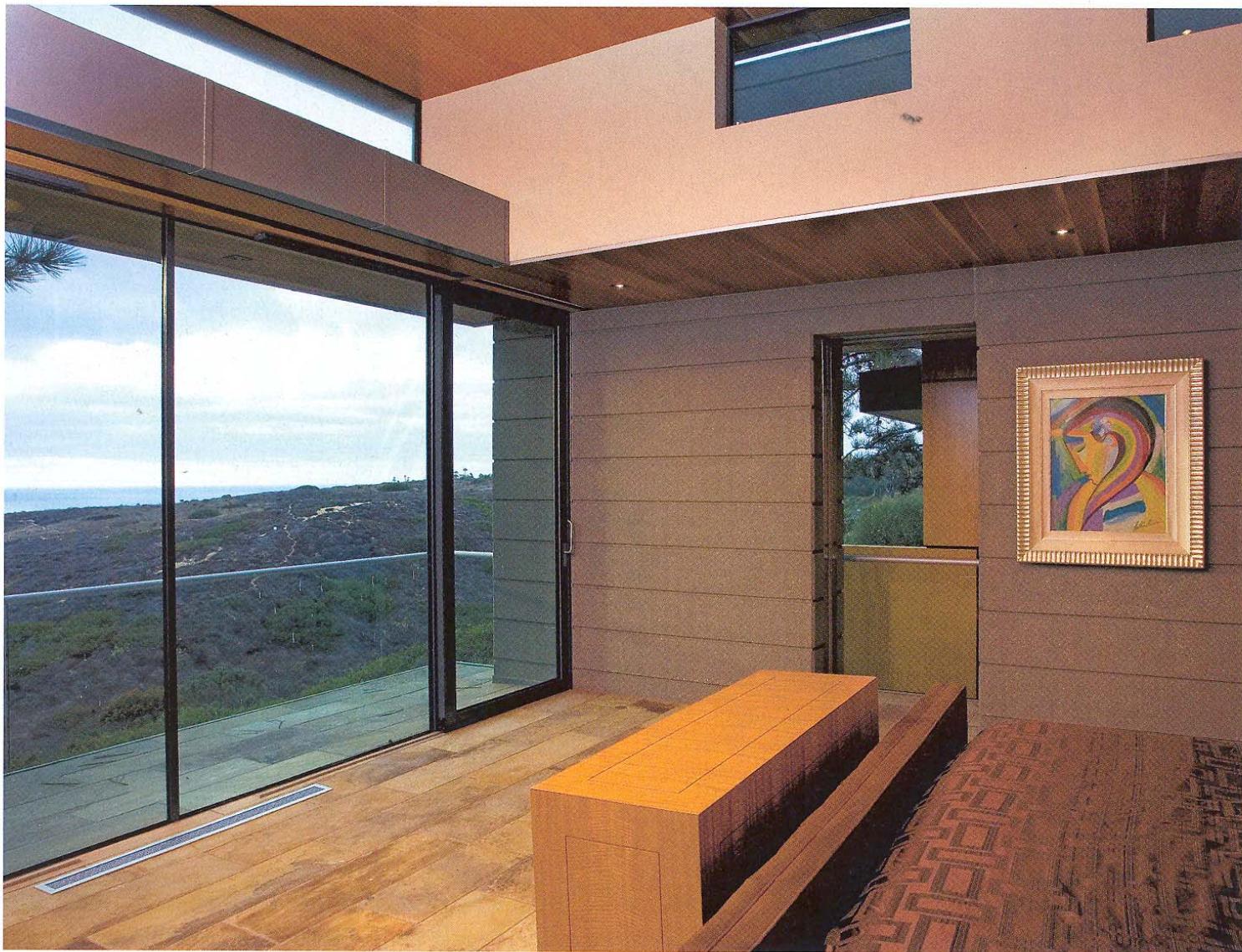
A doorway cut into a concrete wall in the master bedroom leads to a narrow balcony that overlooks the stairway to the basement. The cabinet at the foot of the bed hides a TV that rises into view at the touch of a button.

“I saw some modern art and gave up on the antiques and said I’m a modern contemporary guy,” he said. “I think I’m the only one in the family like that.”