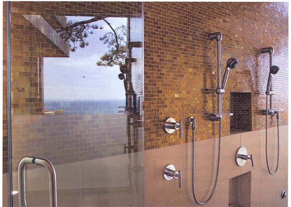
The master bath includes a multispray shower/steam room with a view to the ocean. The area also includes a spa tub and compact washer-dryer.

The Schroeders brought contrasting backgrounds to the project. Dan grew up in Dayton, Ohio, surrounded by family antiques, his mother’s copies of Architectural Digest a fixture on the coffee table. About 15 years ago, he moved to San Diego and made a 180-degree turn in his taste in architecture.