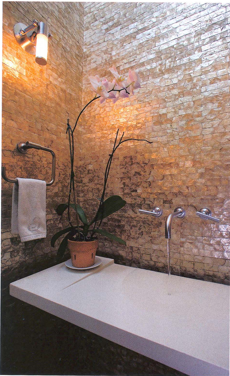
The powder room off the great room glistens, thanks to a skylight and mother-of-pearl wall covering. Water disappears into an unseen drain pipe.

19 1/2-foot-long countertop of CaesarStone, a quartz-based surface, that serves the galley-style kitchen. The shelves are hidden behind sliding doors rather than traditional cabinet doors. The built-in appliances include a four-burner Wolf stove, two Sub-Zero refrigerator-freez-