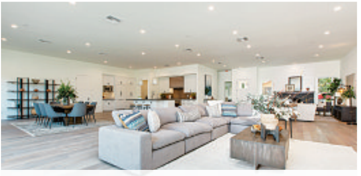
View the photo gallery: 665Albion.com

665 ALBION ST. Single-story custom home. Approx. 4,040 Square feet of living space. 4BR, 3.5BA Open floor plan with 11 ft ceilings. Kitchen includes 6-burner range, griddle and convection oven. Herringbone slate tile fireplace. Master suite with spa-like bath. Large laundry room with storage. 3-car garage. Huge lot with room for pool. $2.850.000.