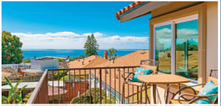
View the photo gallery: 4407DelMar.com

4407 DEL MAR AVE. Large corner lot with excellent views of ocean. city and bay. Light & bright, highly updated 4BR, 2.5+BA, 3,115 sq ft home with a well designed entertainer's open floor plan. Gourmet kitchen with high end appliances. Spa-like master retreat. $1,789.000.