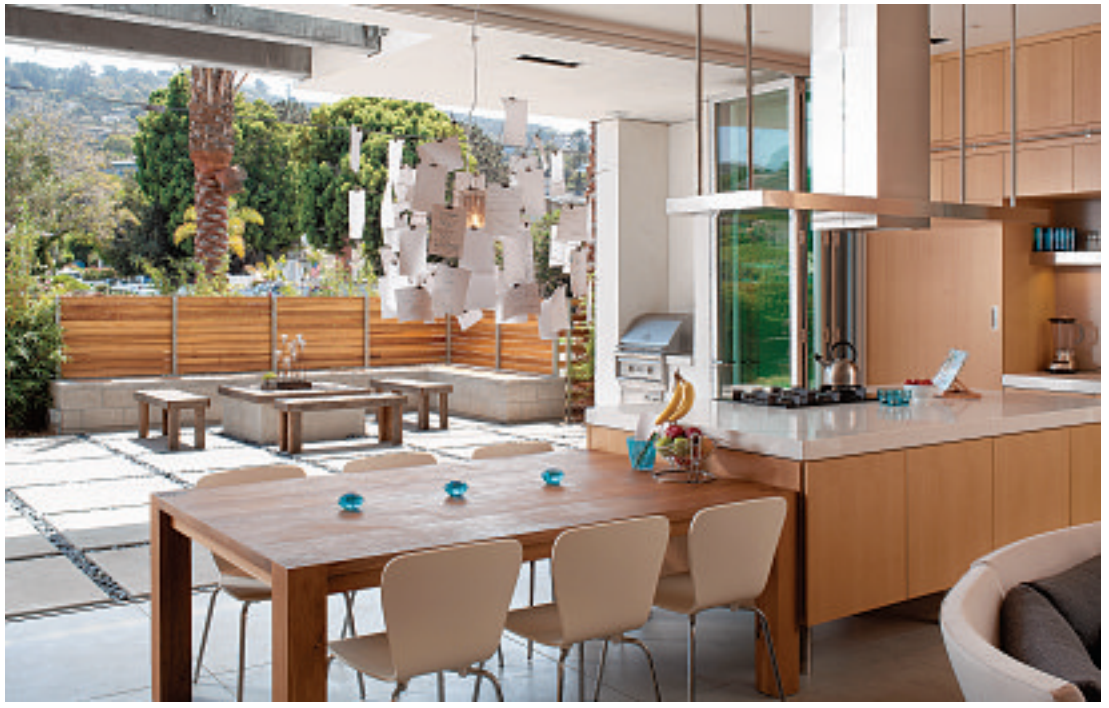
The owner wanted an open floor plan with a large public space that would be inviting for family gatherings. Folding glass doors separate the kitchen from the outdoor living room.